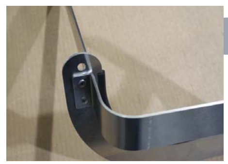
Rivet 1 side plate and Face Plate to a Main Bracket.

Take note in the photos as to how the brackets are positioned. Wall mount holes are located outwards- as to make them 16" on center for proper wall mounting.