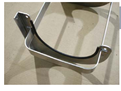
Repeat process for second Main Bracket, Side and Face Plates.